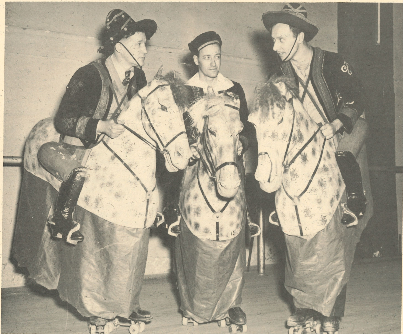
Arena Gardens, 1942