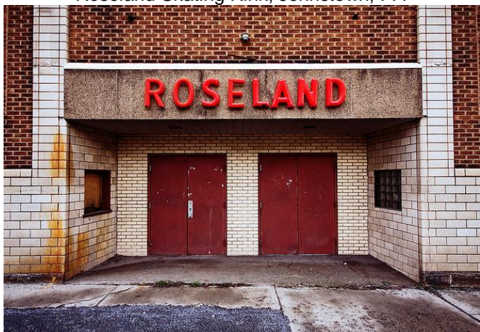
Roseland Skating Rink, Johnstown, PA