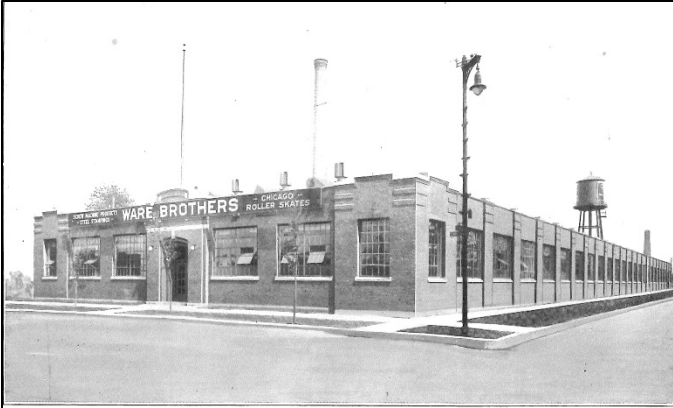
This is the plant that manufactures and stands behind the "Chicago" Roller Skate. The following pictures and letters explain why "Chicago" skates are the most popular and the best. "There is a Reason."

The following is a 1985 interview with Robert Ware Jr of the Chicago Skate Company as reported by the museum newsletter in the fall of 1985.