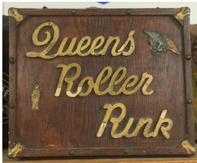
This wooden skate case has "Queens Roller Rink" written on the face and "Lindy" on the back.