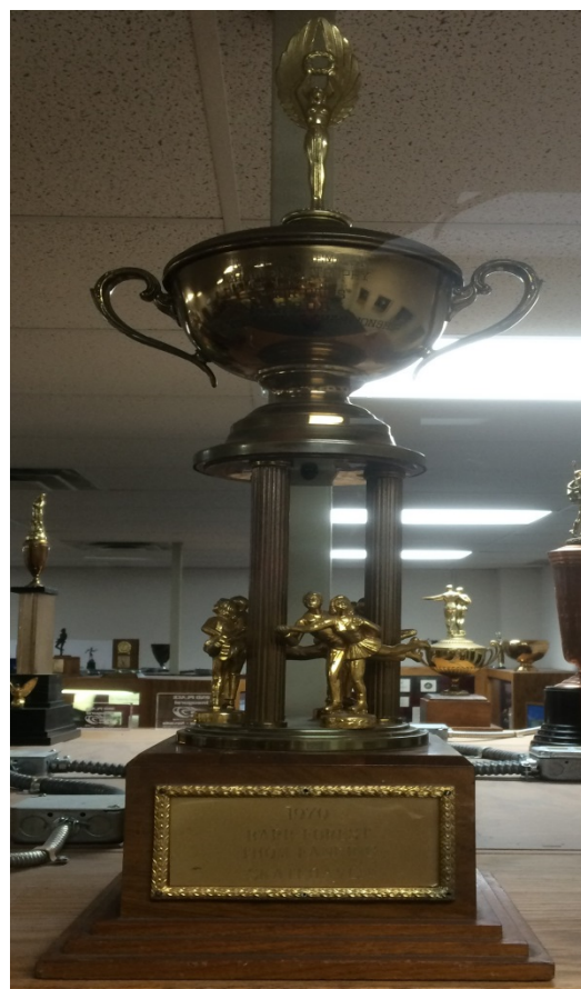
This is the New York State Senior Pairs award known as the Ruth Heesemann Challenge Trophy.

The skates comprise of Betty Lytle boots by Hyde mounted on model 175 Gloria Nord plates by Cleveland Skate Company. These very unsafe skates do have toe stops attached of the Van Horn model. Rounding out the skates are two sets of Cleveland wheels.