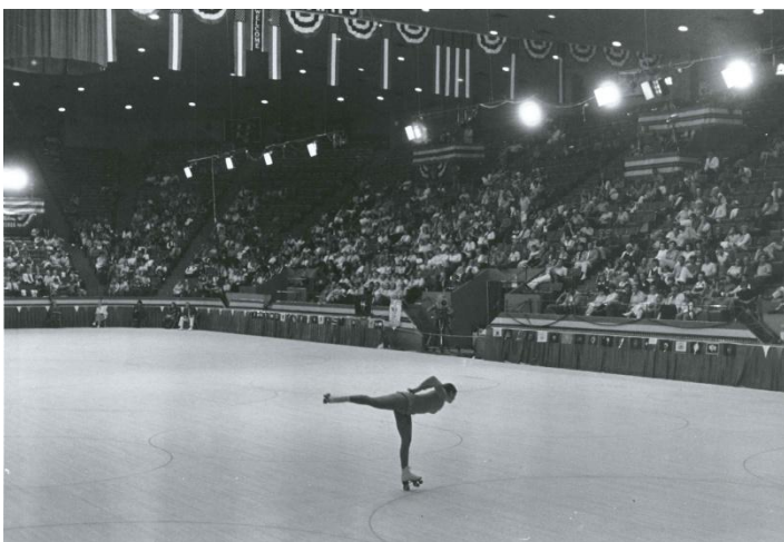
1970 World Championships, Lincoln, NE