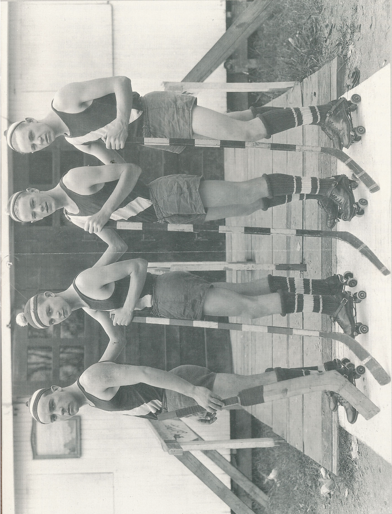
Four man roller hockey team sponsored by McCrory Department Stores at Lowe's Rink in Memphis, Tennessee, 1929. (1983.101.36)