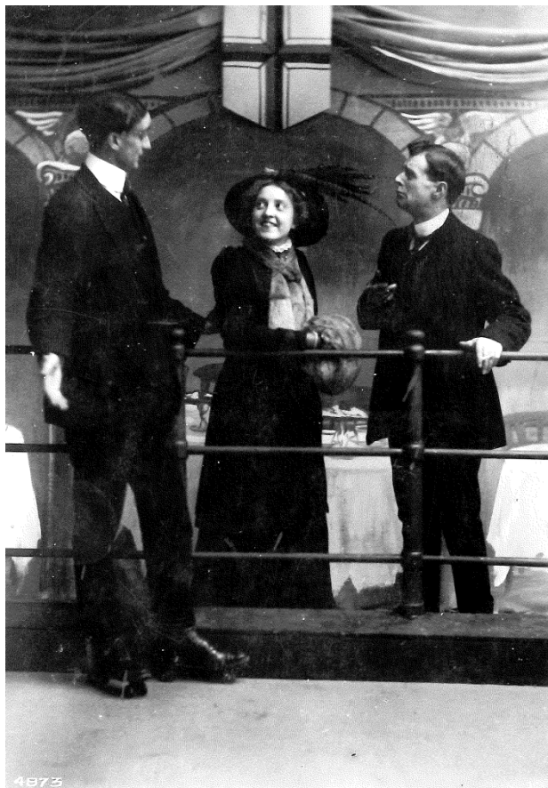
AT THE SKATING RINK.

2) Riedell came through with a donation of a skate and skate boot. These help us showcase modern skates. When visitors ask us what types of skates are used today, I typically show them skates from five or ten years ago; we can now point to this new Riedell skate.