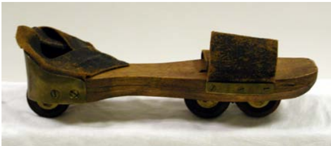
First patented roller skating: Petitbled of 1819.