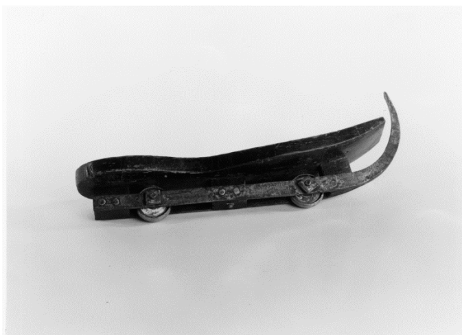
Roller skate developed for the 1849 opera "Le Prophete". It was meant to simulate ice skating on the stage. The success of the stage show led to an increased interest in roller skating.